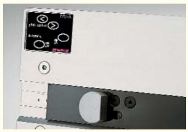
paper stop with sensor activates the punching cycle